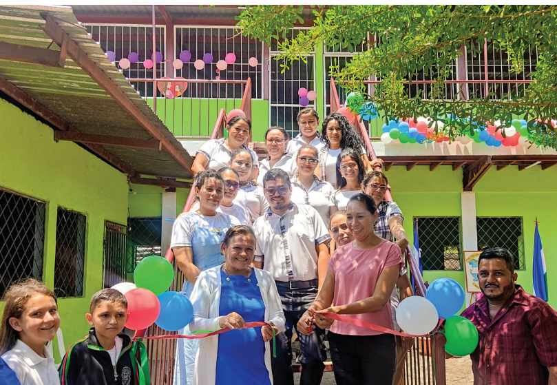
With new classrooms, Nueva Jerusalén can now serve more students and continue being a model school in its community.