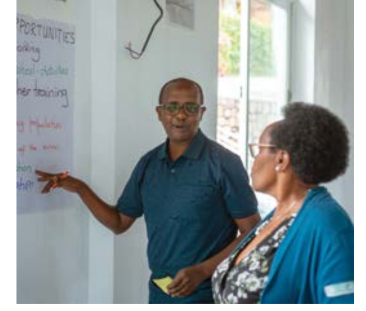
Will you come alongside emerging leaders around the world? They have passion and skill, but they could really use your support too.

Will you help this amazing work continue? Make a gift today to come alongside emerging leaders and take their organizations to new heights.