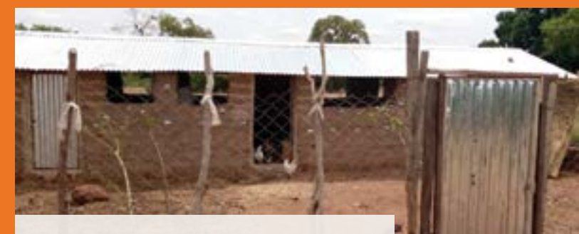
The henhouse at Neguéni school is full of excitement thanks to you.